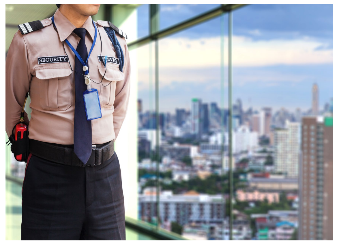
Bookerman | The Metro Kochi

The future plan is to export milk and milk